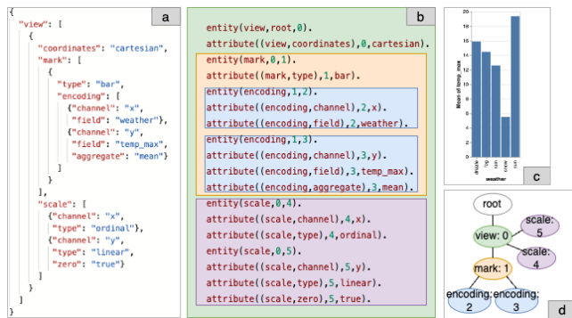
Figure 1: (a) Chart specification as a nested dictionary (left, here as a Python dict ), (b) flattened list of logical facts (middle, in Answer Set Programming), (c) the rendered visualization result, and (d) the skeleton abstracted from the logical format.

Draco specifies the nested chart specification with two kinds of facts: entity and attribute as shown in Figure 1. Entities describe objects and their association with unique identifiers, while attributes describe the properties of entities. For example, entity(mark, v0, m1). attribute((mark, type), m1, bar) specifies a mark object m1 of type bar on the view object v0 .