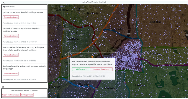
Figure 1: A view of the prototype system for the epidemic dataset.